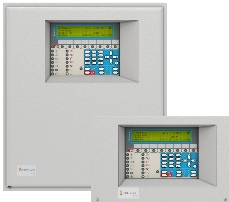
Figure 1: FC503 front panel with FC500 repeater

The FC503 auto-addressing panel has 3 in 1 loops that can support up to 250 addressable devices and 128 zones. An IP board is available as an option for this panel.