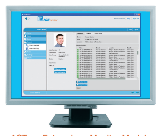
ACTpro Enterprise - Monitor Module