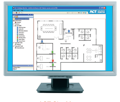
ACT Site Maps